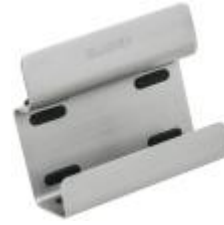
Stainless Steel Magnetic Caddy, for Stainless Steel sinks 230694